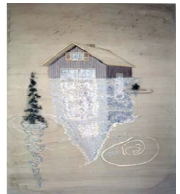
Left to right: Hollow Hill, 1999, Acrylic and thread on linen, 152 x 203 cm.; Hindsight, 1999. Acrylic and thread on linen, 198 x 167.5 cm.