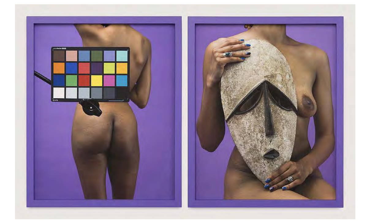
Awol Erizku, Study of the body with a Mask , 2018.

Notable one-person exhibitions in the Profile section of the fair included Sara Rahbar's poetic assemblages mixing tools of workers' trades with flags and cast body parts, priced between $38,000 and $62,000, at Dubai's Carbon 12; Fu Xiaotong's sublime installation of pinpricked, handmade paper that ebbs and flows like waves through her multipaneled piece, priced at $33,000 per panel, at Chambers Fine Art, from New York and Beijing; and New York's Derek Eller Gallery's showing of whimsical works on paper, priced from $10,000 to $65,000, by Chicago Imagist artist Karl Wirsum, who is featured in the Art Institute of Chicago's newly opened exhibition "Harry Who? 1966– 1969."