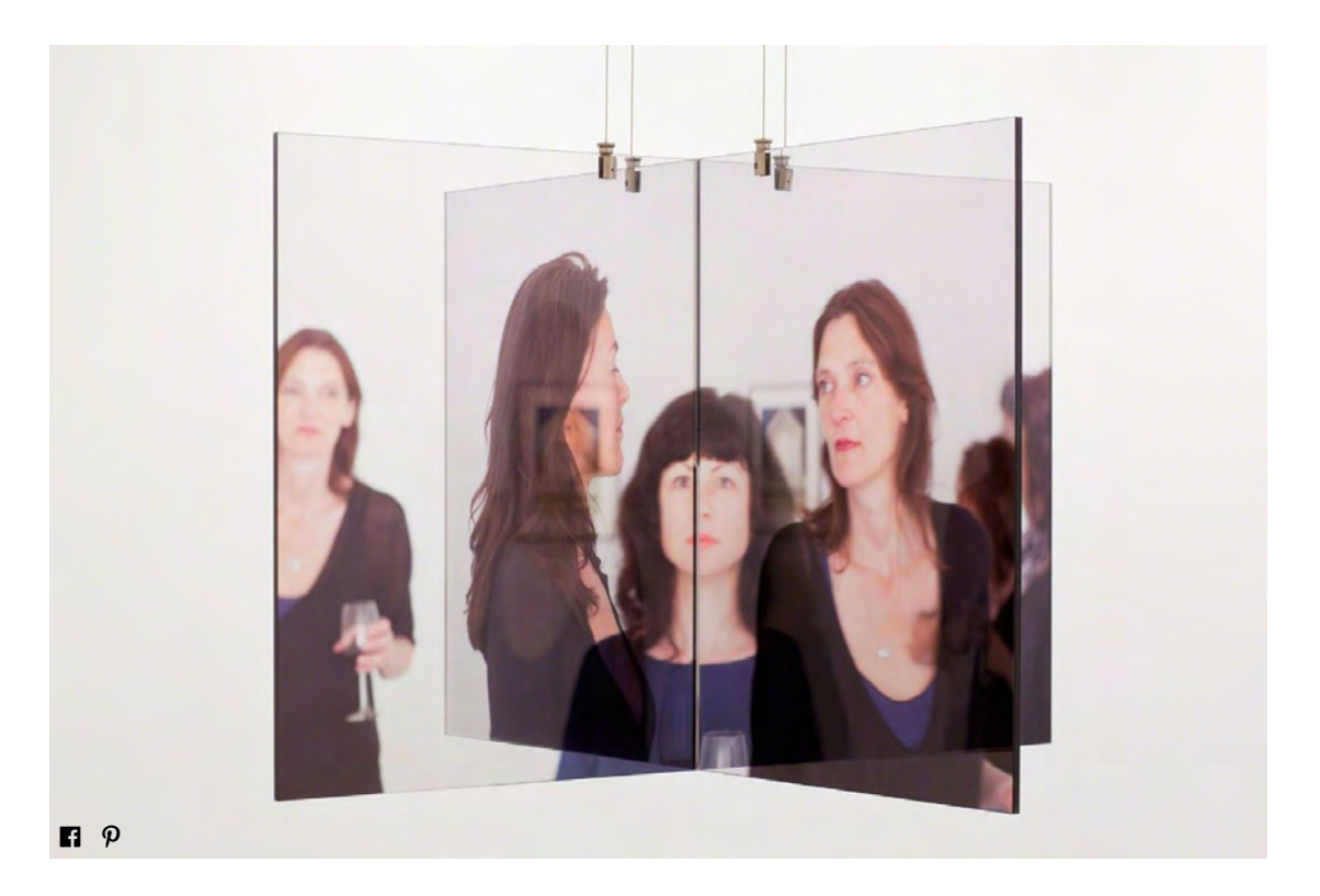
Ger van Elk, As Is, as Was, 2012.

Catching our eye were three shows of emerging African artists. Awol Erizku offered new color photographs of seductive still lifes combining the tools of photography with African artifacts and nude models at Los Angeles's Night Gallery. New York's Sapar Contemporary displayed 34 drawings by Phoebe Boswell of a surreal army of women with eyes for heads hung on charcoal-smudged walls with scattered rocks to create a landscape environment for her rambling figures. And Clotilde Jimenez presented large-scale collages of referential motifs from such modernist artists as Manet and Matisse, along with a pair of big sculptural heads of black children, expressively created in clay and cast in bronze, at Seattle's Mariane Ibrahim.