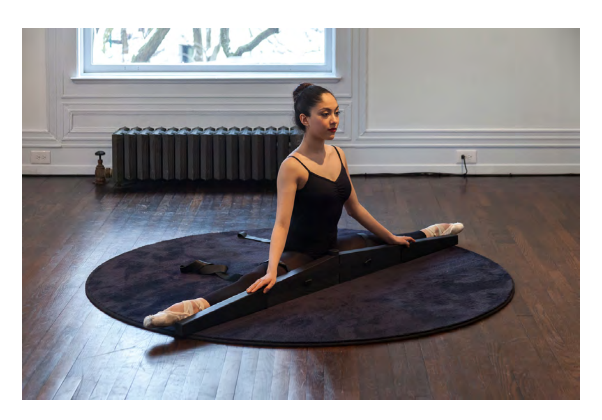
Brendan Fernandes, In Second , 2018.

Solo shows are also a standout at any art fair, and Expo Chicago featured a number of compelling ones this year. The late works of Dutch conceptual artist Ger van Elk filled the shared booth of the Amsterdam-based dealers Grimm and Borzo Gallery, which mounted his final solo exhibitions from 2012, "As Is, as Was" and "As Was, as Is." The hanging here featured the artist's hybrid series of "Conclusion" paintings, consisting of photographs of Spanish village scenes printed on canvas and primarily painted out to show imagery only at the edge, and a striking series of portraits of female friends printed on clear acetate sandwiched between layers of Plexiglas and smartly displayed.