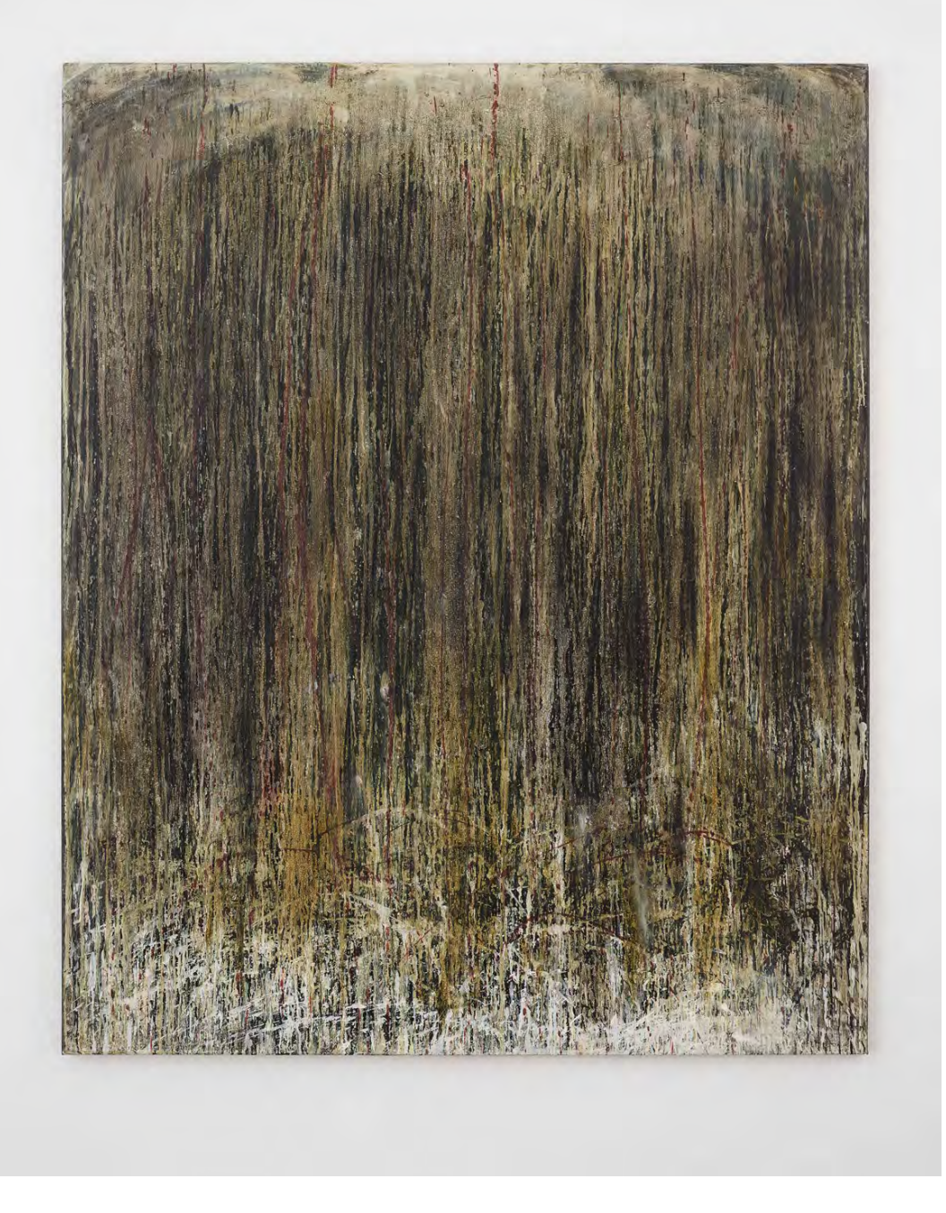
Pat Steir, Ancient Waterfall , 1989.

Sales were underway within hours of collectors hitting the aisles of the main Galleries section of the fair, with New York's Lévy Gorvy selling Pat Steir's large-scale 1989 painting Ancient Waterfall for $750,000 and Half Gallery, also from New York, nearly selling out its booth of colorful figurative and abstract canvases, priced between $7,500 and $16,000, by 2018 Yale MFA grad Vaughn Spann. Galerie Templon, from Paris and Brussels, also scored quickly with the sale of Iván Navarro's 2017 sculpture Revolution V — consisting of five stacked drums displaying the words demand, clamor, strike, blast, and rise in neon with mirrors that repeat the chant while creating the illusion of depth in each of the variously sized instruments—for $185,000.