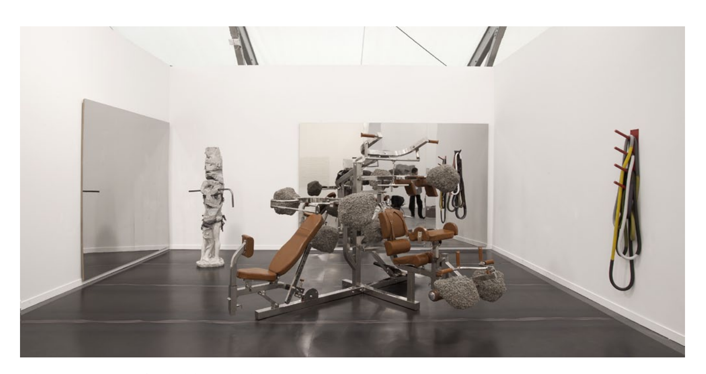
Nick van Woert, Universal Gym, 2013 (installation view)