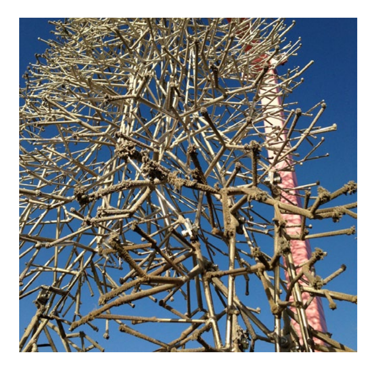
Nick van Woert, Primitive, 2013 (detail)

The pose of the figure and the structure it hangs from alludes to Vitruvius' Primitive Hut, a principle revolving around post and beam construction which all architecture was believed to embody. Simple structure and simple man blowing in the wind."