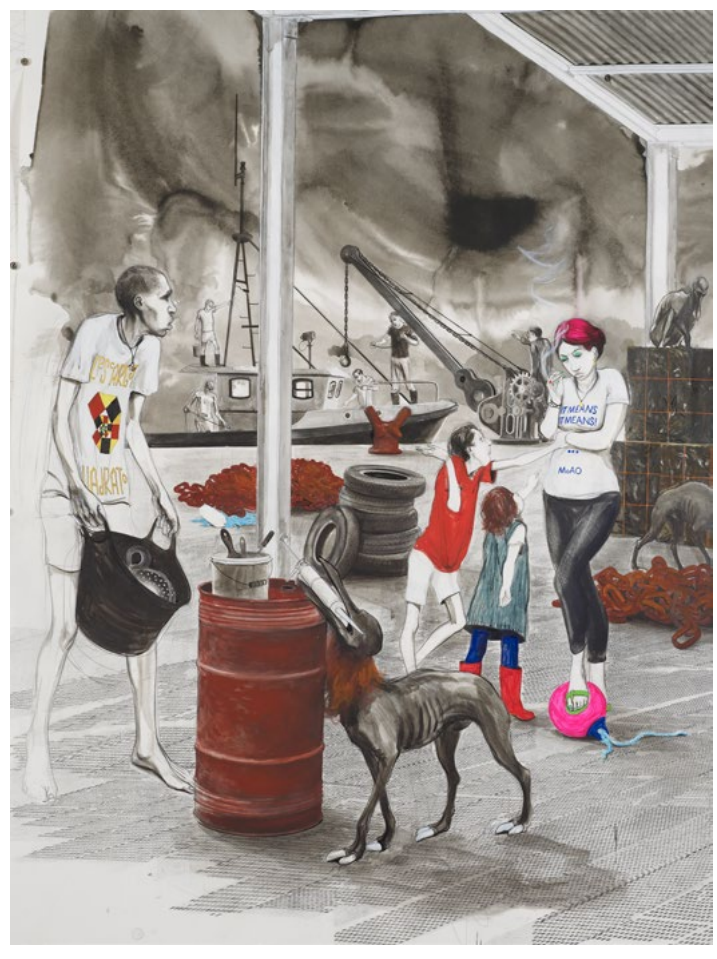
Charles Avery, Untitled (View inside the kelp bailing station), (2014) | detail

All comes through the Kelp Bailing Station , where it is dehumidified, compressed, and bound into bails, for wholesale to industry, a major use being the extraction of minerals used in the production of glass.