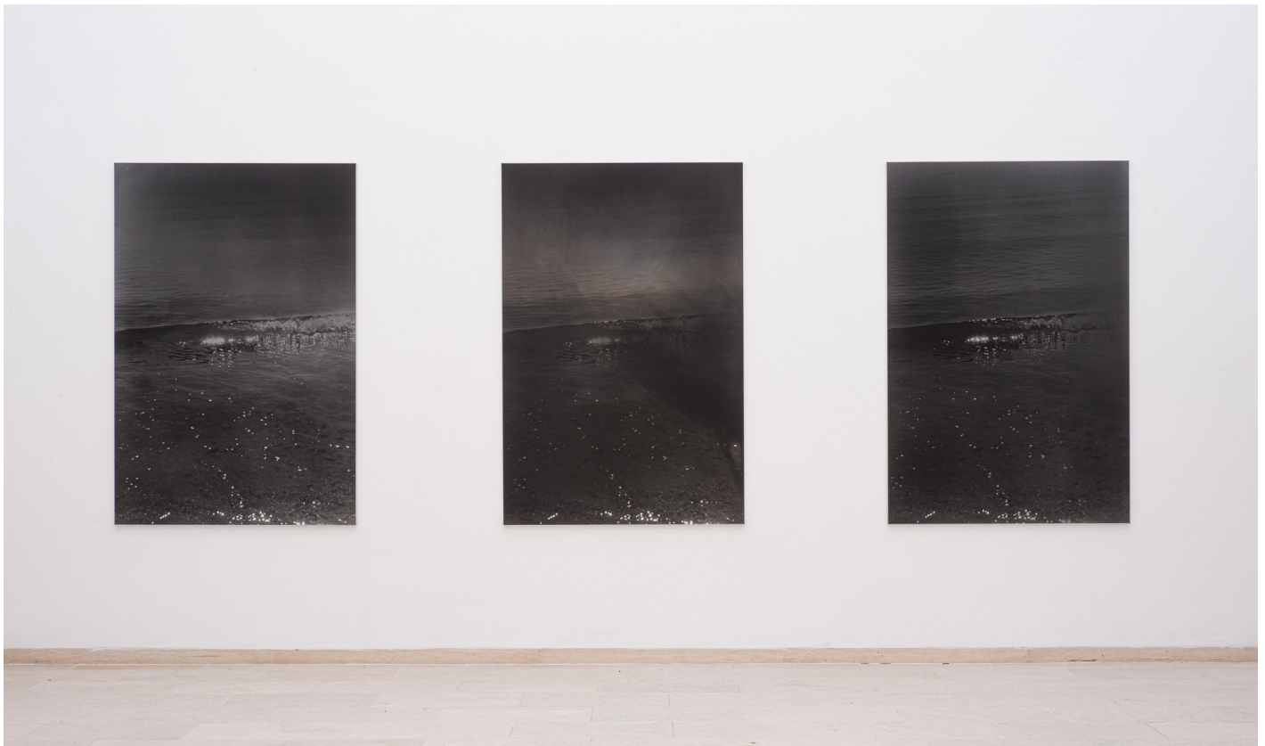
Installation view | Dirk Braeckman | 57 th Venice Biennale, Venice (IT), 2017