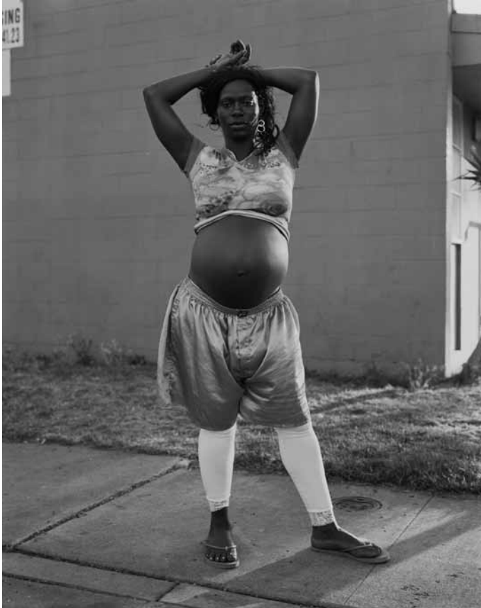
J 50, 2008