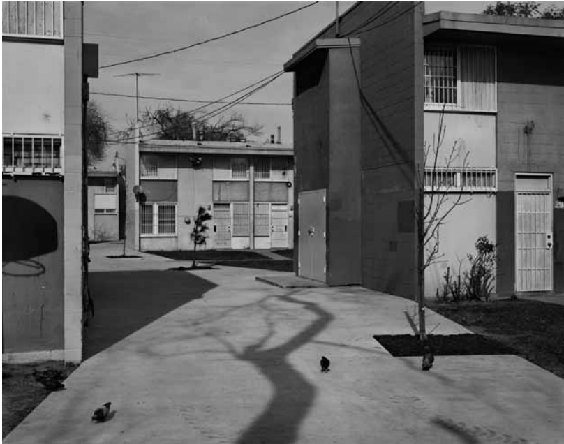
Untitled IX, 2010