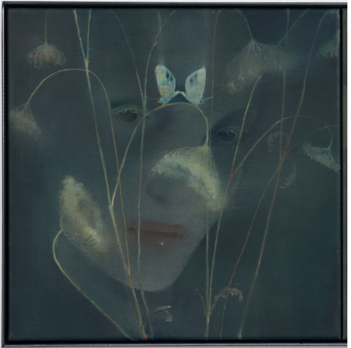
Anna Ruth, 'Two' and 'Burned to Ashes', 2025 Acrylic and pigment on canvas in steel frame, diptych 36.3 x 71.4 cm | 14 1/4 x 28 1/8 in