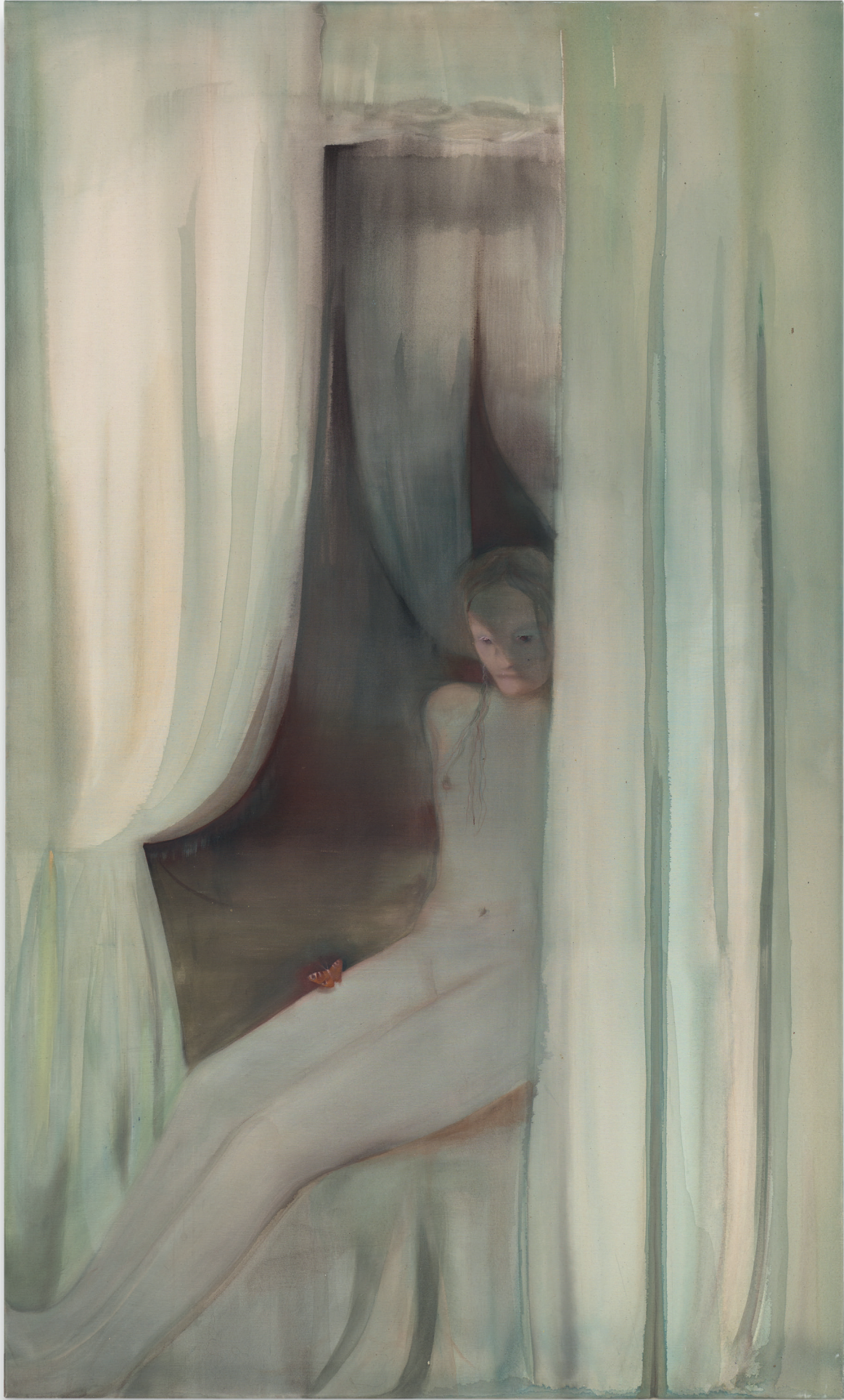
Anna Ruth, Final Form, 2024 Acrylic and pigment on canvas 250 x 150 cm | 98 3/8 x 59 in

Courtesy of the artist and GRIMM Amsterdam | New York | London Copyright the Artist Photo: Stephen White & Co.