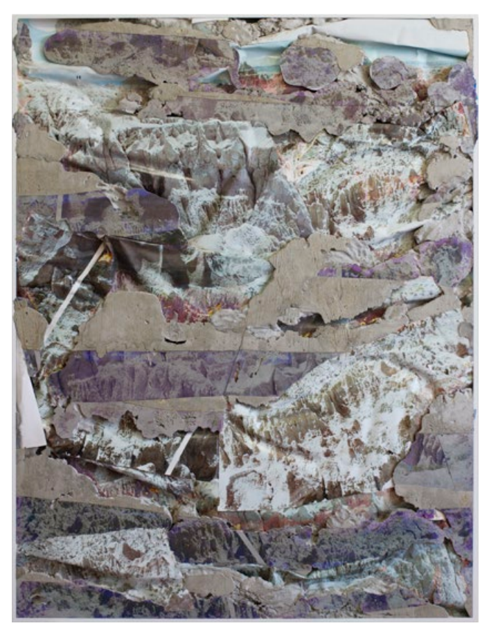
Letha Wilson, Badlands Concrete Bend, 2015

In Letha Wilson's own words: "My artwork uses images I have photographed in the natural landscape as a starting point for interpretation and confrontation. My work creates relationships between architecture and nature, the gallery space and the American wilderness. In the photobased sculptures the ability for a photograph to transport the viewer is both called upon, and questioned; landscape photography is approached with equal parts reverence and skepticism."