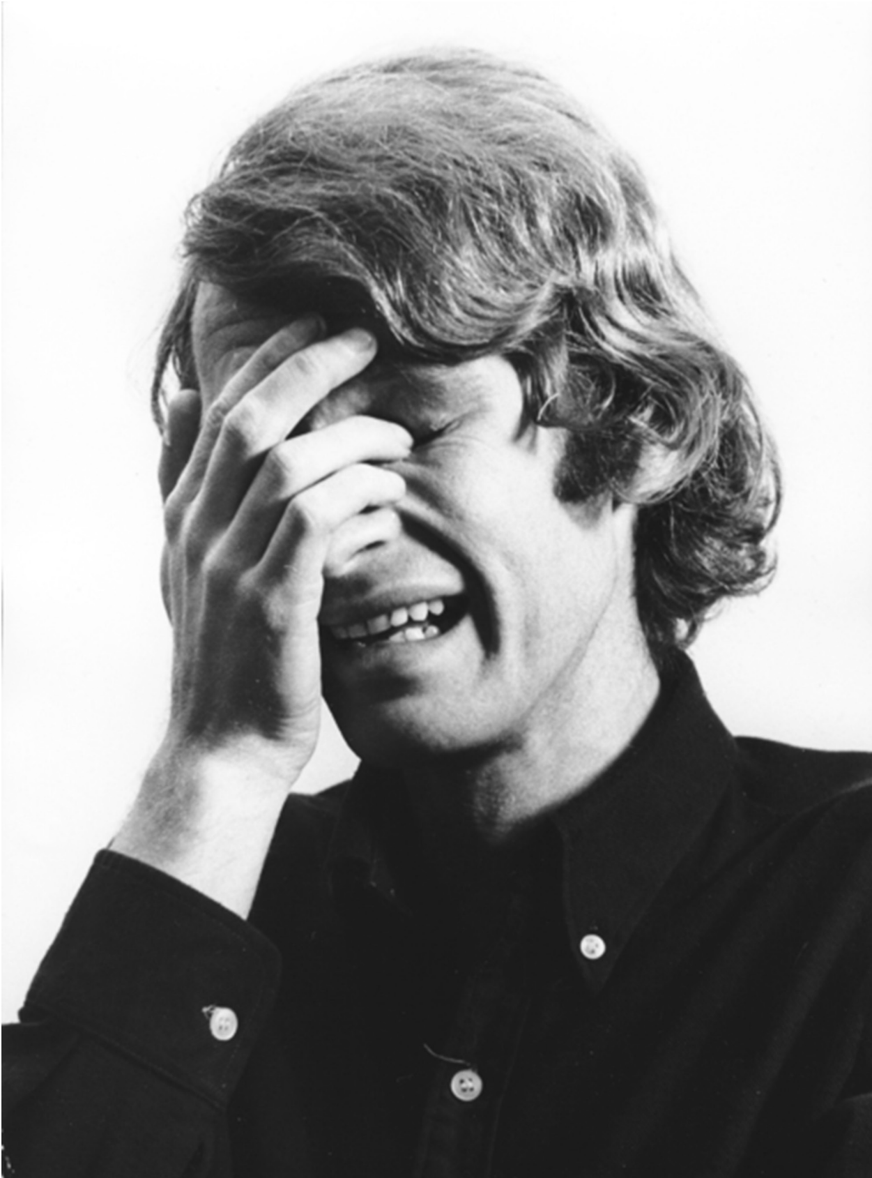
Bas Jan Ader - Study for I'm too sad to tell you , 1971