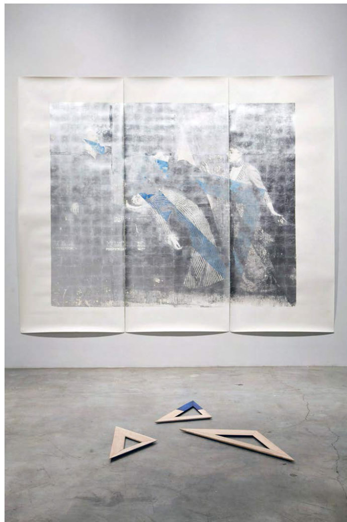
Untitled | 2009

Skaer's interest lies in the transformation of matter and in objects that have lost connection to their original time and place. Her works often repurpose existing forms, from other artworks or from the shapes that raw material arrives in (such as ingots, slices of tree, boulders). Meaning is mutable. Several works in this show turn inward and backward, borrowing their form from earlier pieces. A huge black drawing made from intricate marks is itself an amalgamation of the previous drawings that Skaer has made in this technique, all of the images now enmeshed and overlapping. Sticks & Stones (2013 - 2016) is a sequence of evolving sculptural copies, each made from the one directly before it. The originating sculpture was made from a large slice of 'sinker' mahogany, which had lain undiscovered on the riverbed in Belize for over 100 years. This was combined with left over materials,