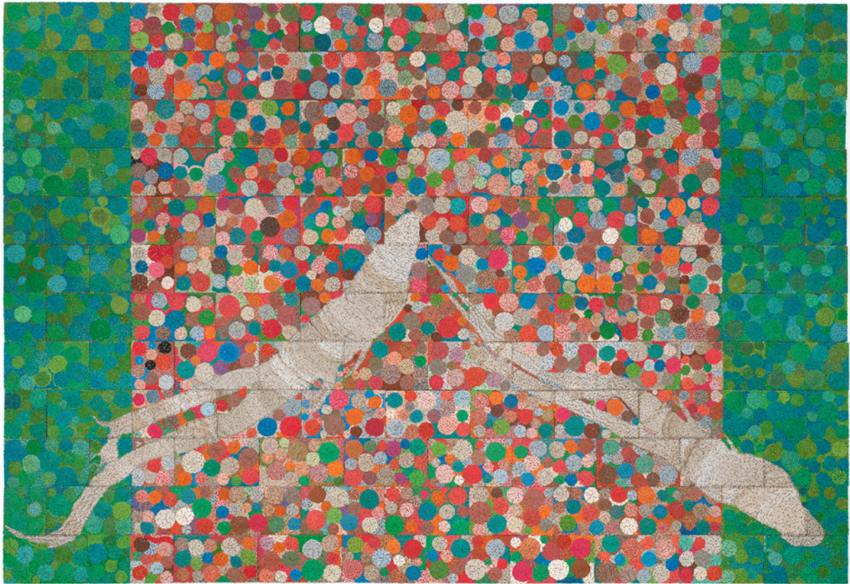
Elias Sime | Tightrope: Evolution (1) | 2017 | Reclaimed electronic components on panel | 279.4 x 422.3 cm | 110 x 166 1 / 4 in