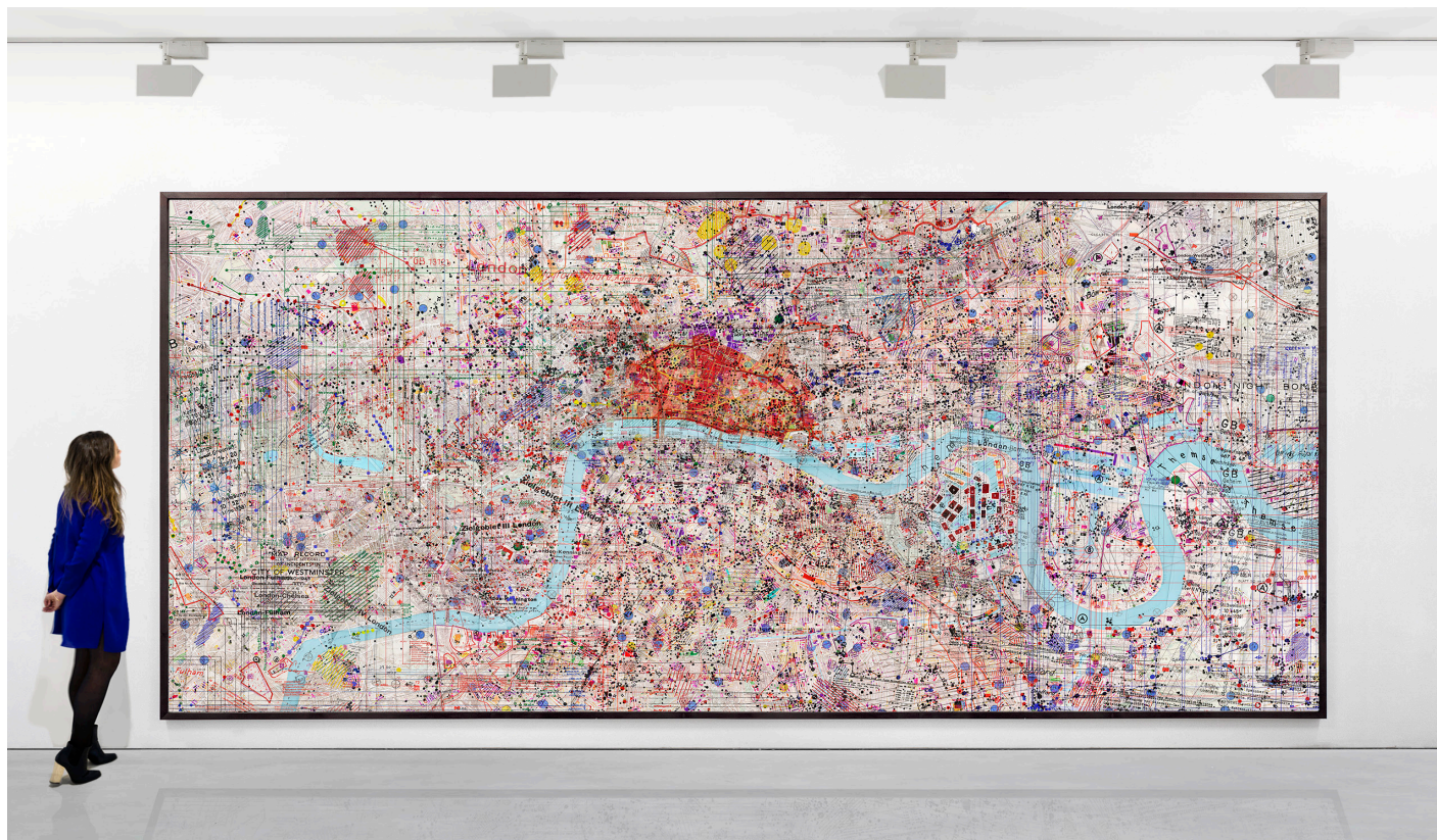
Gert Jan Kocken | Depictions of London | 2019

GRIMM is proud to announce a solo exhibition by Gert Jan Kocken (1971 Ravenstein, NL). The exhibition Organized Complexity combines a selection from the artist's eminent Depictions series with works from his Fission series .