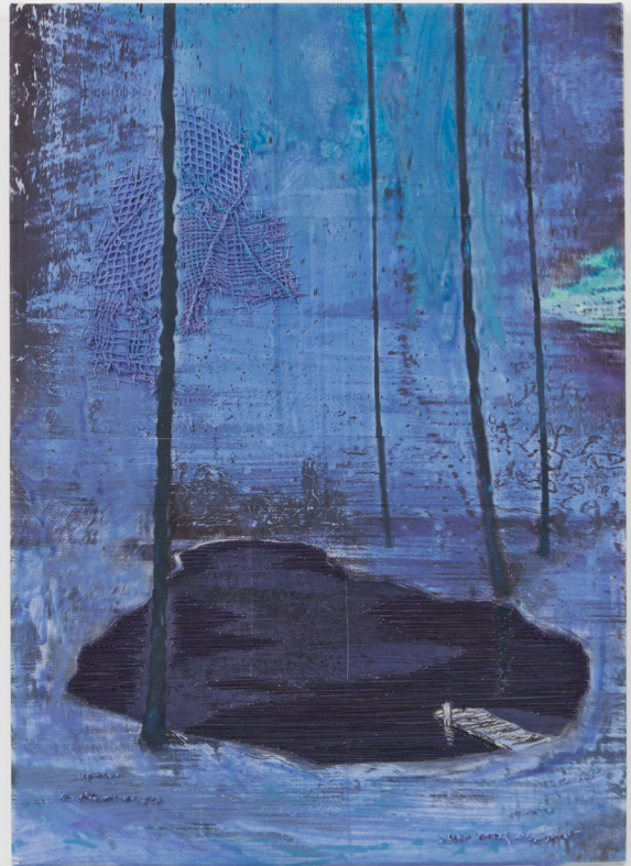
Michael Raedecker | demo (drift) | 2020

The artist continues to use a combination of embroidery, inkjet transfers, and acrylic, with a singular ability to coalesce these media in a fluid painterly language. This is articulated in the depiction of suburban homes; a recurring symbol, styled as the modern bungalows which ubiquitously dot the landscapes of many countries. Onto their forms the viewer can project any number of stories, perhaps in succession as the lifespan of houses is much longer than our own. These structures are so familiar that they blend seamlessly with the surrounding terrain. Yet