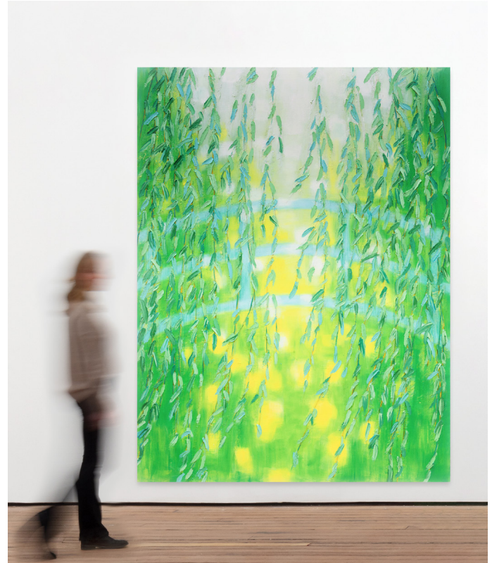
Robert Zandvliet | Paradaidha Pons , 2023

While deeply concerned with elemental subjects and the natural world, Zandvliet's work resists realism, instead capturing and drawing attention to the artifice and painterly gesture of the work. His career has been one of constant evolution and experimentation, exploring the interplay of light and shadow, ideas around authenticity and reproduction, the materiality of the canvas and the distinct qualities of line, colour and depth to relate to landscape and space. Using landscape as a framework, his minimal approach shifts and merges foreground and background, subject and negative space, to reorient the viewer's perception of depth and surface.