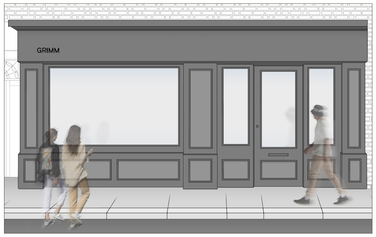
Rendering of GRIMM London at 2 Bourdon Street, London (UK)

GRIMM is thrilled to announce its expansion to London with a new gallery in Mayfair opening to the public this Fall. On September 14, GRIMM will launch its London program with an inaugural exhibition of new sculptural works by UK multimedia artist Lucy Skaer. The new London space will be located right off Berkeley Square at 2 Bourdon Street, and marks the third city for the Amsterdam-founded gallery. Established by Jorg Grimm in Amsterdam in 2005, the gallery's first international expansion came in 2017 when it opened in New York (first on the Bowery and since 2021 in the heart of Tribeca); and now in September, it will add London to that mix.