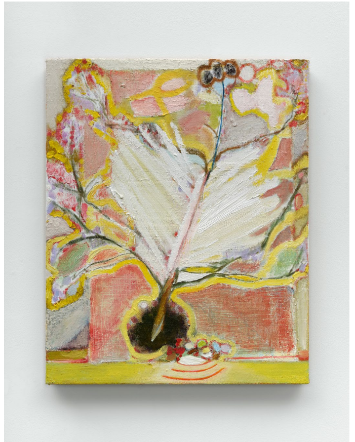
Gabriella Boyd | Brute , 2023