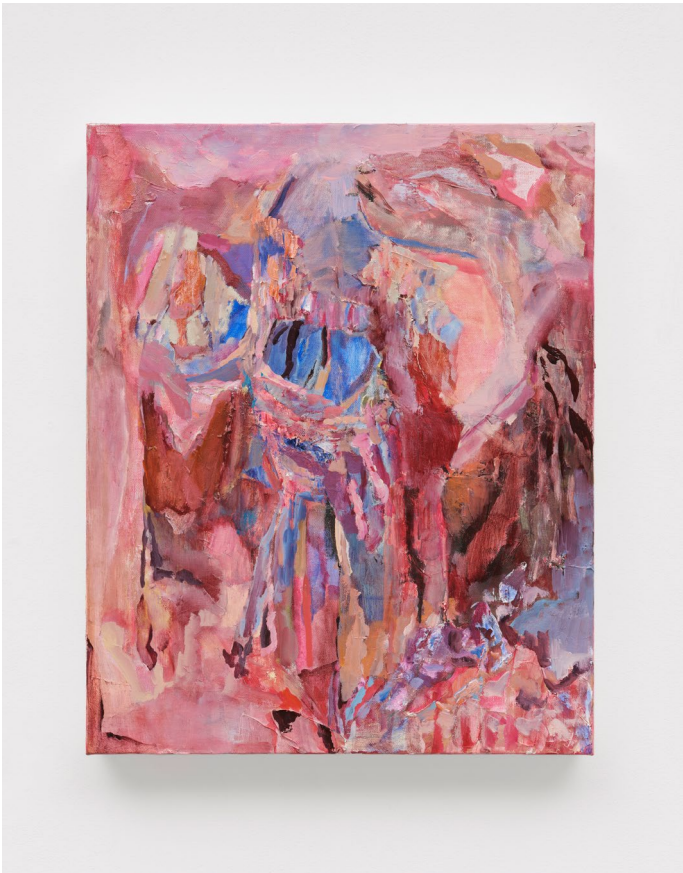
Francesca Mollett | Burning mirror , 2023